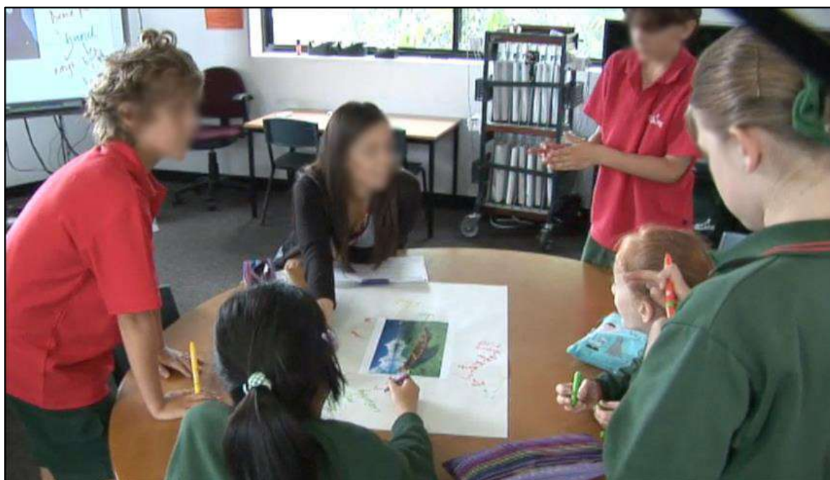
Figure 2: Teacher 2 at Balliang PS (at 14 min)