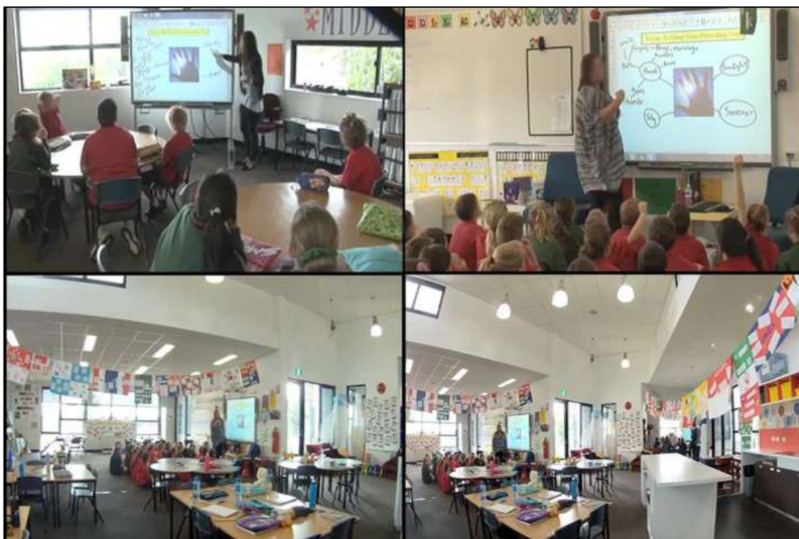
Figure 7. Content instruction at Balliang PS (at 6 min 40 sec.)