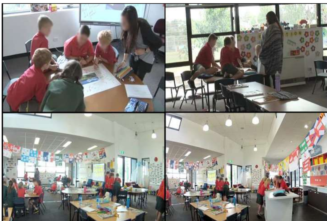
Figure 8. Conferencing at Balliang PS (at 25 min 45 sec)