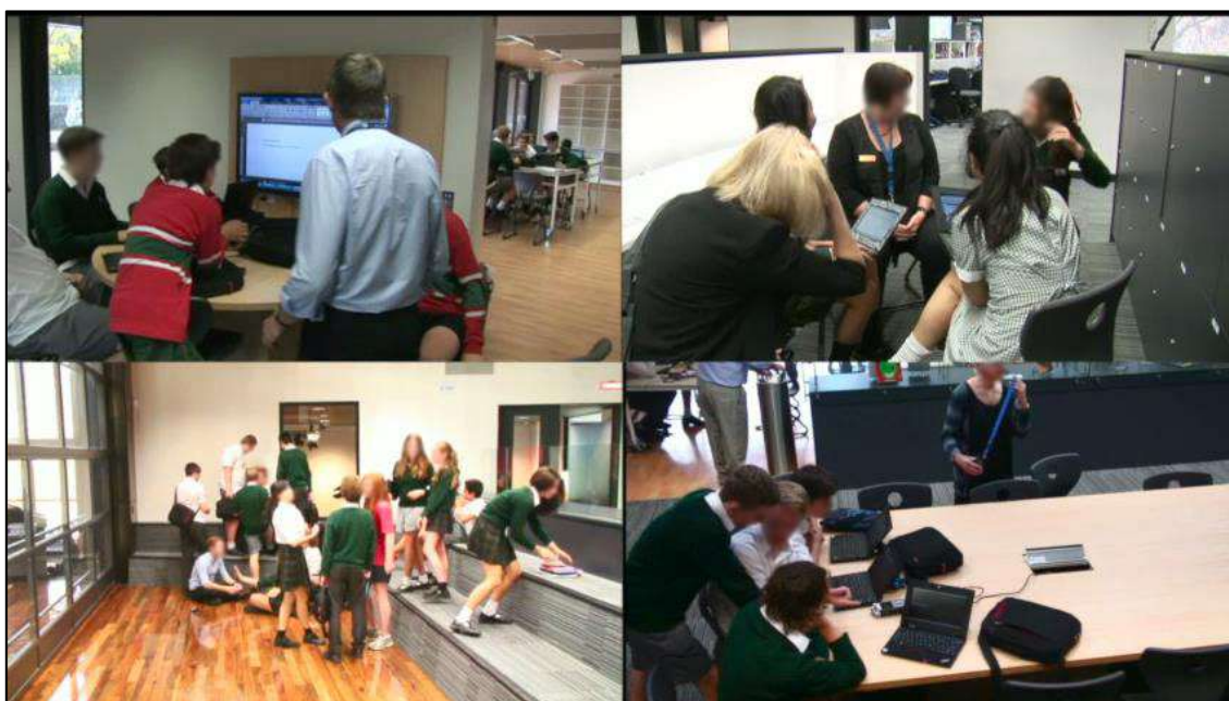
Figure 6. Conferencing at Central Park HS (at 33 minutes)