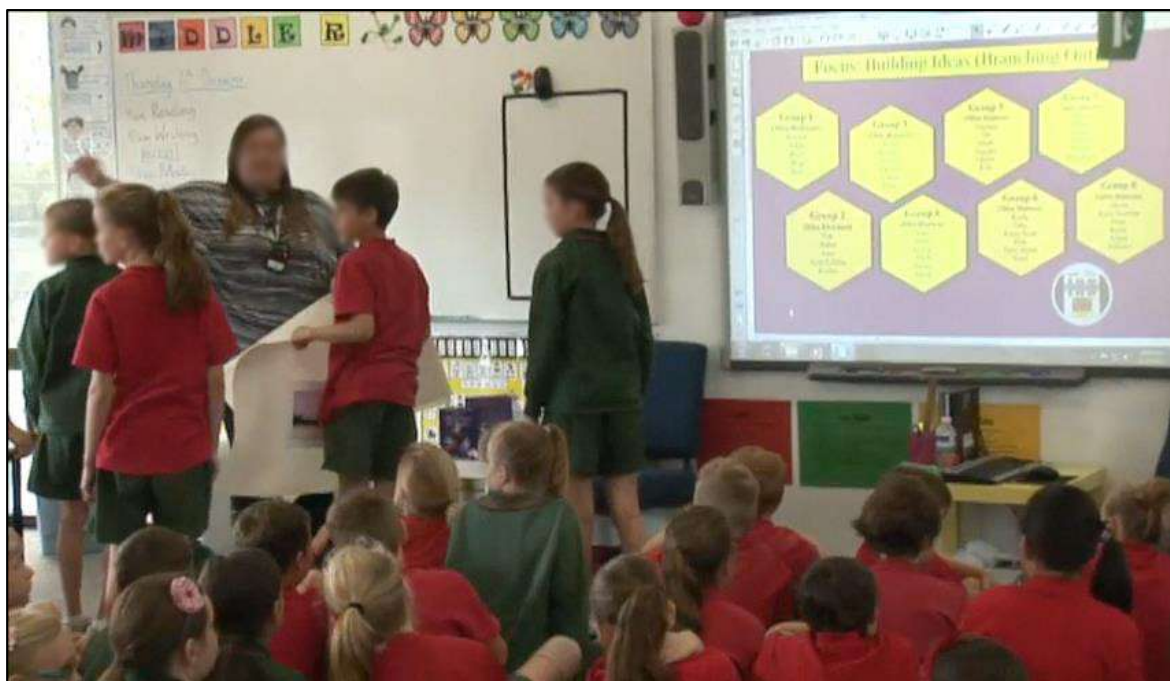
Figure 1: Teacher 1 at Balliang PS (at 11 min 45 sec)