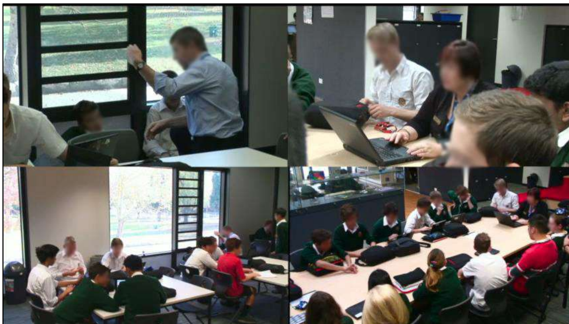
Figure 5: Organizational instruction at Central Park HS (at 16 minutes)

The following figures (Figures 5-8) show the snapshots of the types of activities that were coded using the system outlined above. The 'who', 'where' and 'what' were identified from these '4-ups', that show concurrent teacher practice in shared spaces.